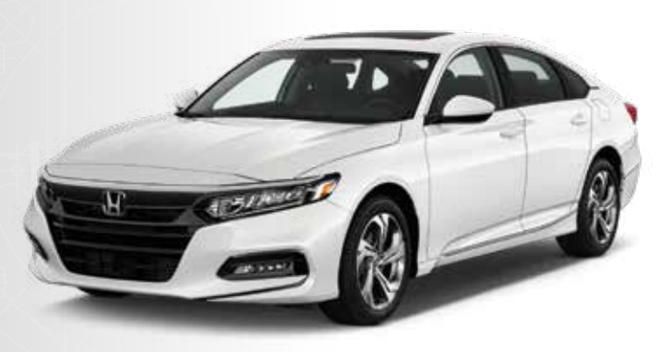
2018+ (10<sup>th</sup> Gen) Honda Accord