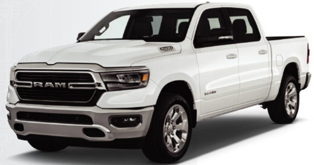
2019 and newer (5 th Generation) RAM 1500