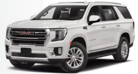
2025-2019 GM SUV