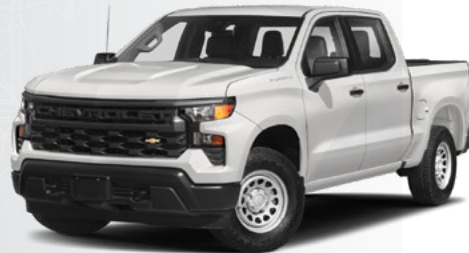
2025-2019 GM 1500 Truck