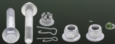
Hardware included for complete install

Mevotech TTX CTXMS501337 and CTXMS501338 are the patented and engineered solution for long service life front upper control arms on the GM 1500 pickups and full size SUVs.