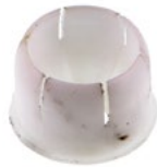
OE-STYLE Plastic bearing