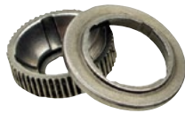
TTX Sintered upper and lower bearings

TTX patented self-lubricating sintered greaseable bearings provide extra endurance and durability to get more life out of parts, when compared to OE-style plastic bearings. (US Patent N° 9296271 & 10527089)