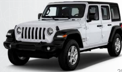
2022-2018 Jeep Wrangler JL/JLU