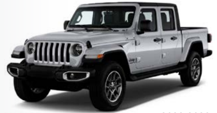
2022-2020 Jeep Gladiator JT