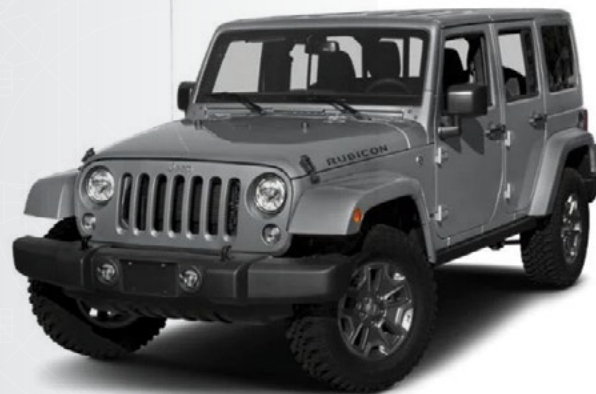
2018-1984 Jeep and Dodge RAM with DANA 30 & 44 Front Axles