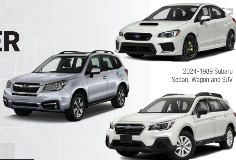
2024-1989 Subaru Sedan, Wagon and SUV