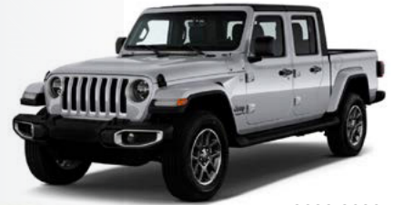
2023-2020 Jeep Gladiator JT