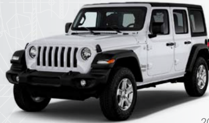
2023-2018 Jeep Wrangler JL/JLU