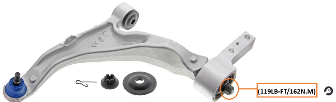
Figure 1. Bushing bracket nut (circled above) must be correctly torqued after fitting control arm to vehicle