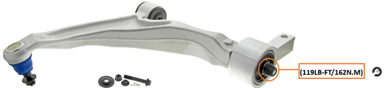
Figure 1. Bushing bracket nut (circled above) must be correctly torqued after fitting control arm to vehicle