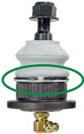
Figure 1. Circlip is securely fitted to boot. Both circlip and boot are properly located onto machined housing groove.

The above steps are illustrated in Figure 2.