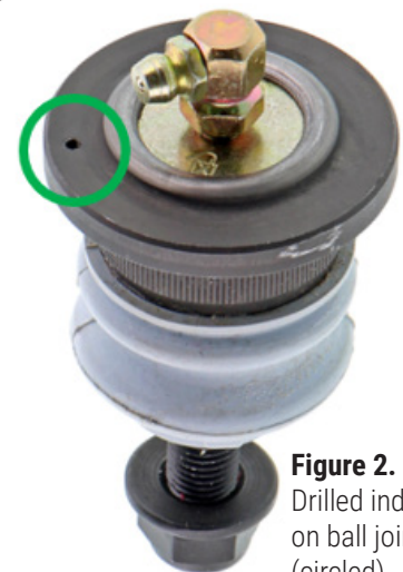
Figure 2. Drilled index mark on ball joint flange (circled)