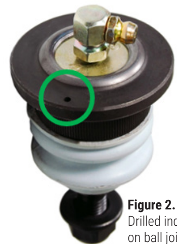
Figure 2. Drilled index mark on ball joint flange (circled)