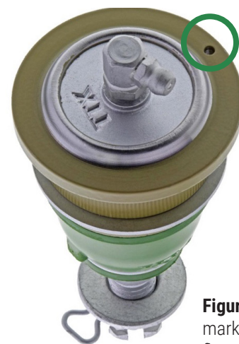
Figure 2. Drilled index mark on ball joint flange (circled)