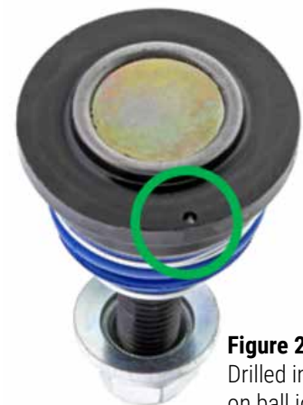
Figure 2. Drilled index mark on ball joint flange (circled)