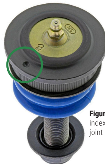
Figure 2. Drilled index mark on ball joint flange (circled)