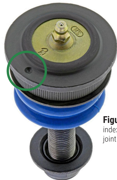
Figure 2. Drilled index mark on ball joint flange (circled)