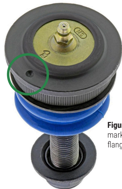
Figure 2. Drilled index mark on ball joint flange (circled)