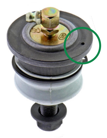
Figure 1. Ball joint index mark. In this example, the index mark is a hole.

Technical Support Hotline: 1.844.572.1304