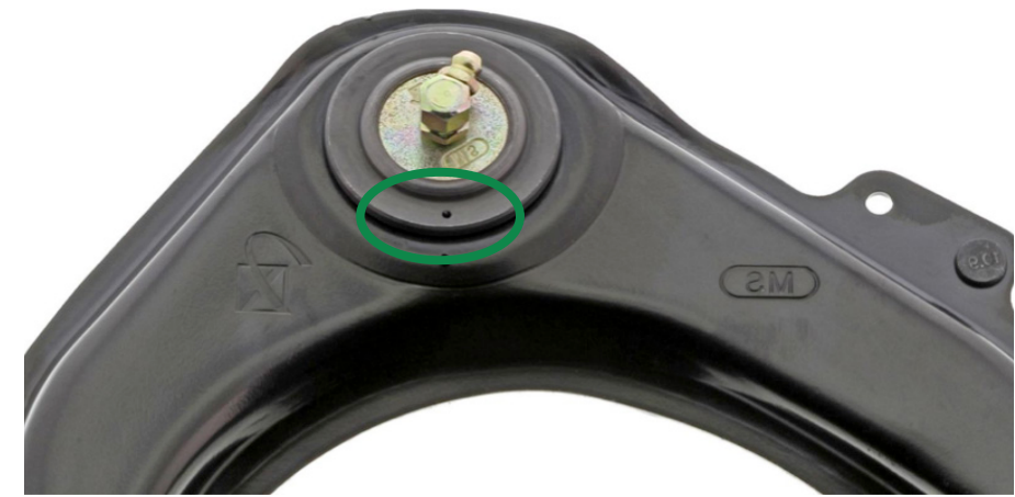
Figure 2. Control arm index mark. In this example, the index mark is a hole.