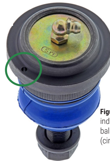
Figure 2. Drilled index mark on ball joint flange (circled)