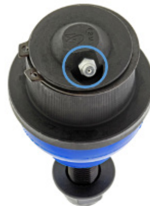
Figure 1. To ensure adequate clearance between components and accessibility for future relubrication service, ball joint must be installed with grease fitting parallel to front lower control arm stop out tab

Always ensure to refer to the factory service manual for correct diagnostic procedures, component removal and installation methods and fastening torque values and procedures where applicable. Only use a calibrated torque wrench for final fastening.