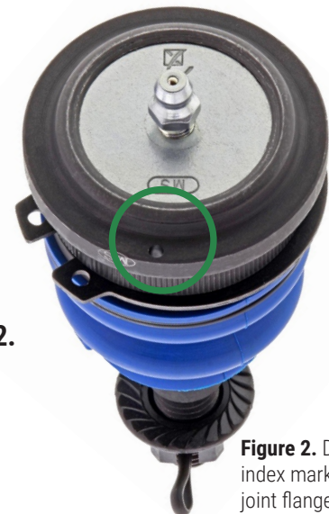
Figure 2. Drilled index mark on ball joint flange (circled)