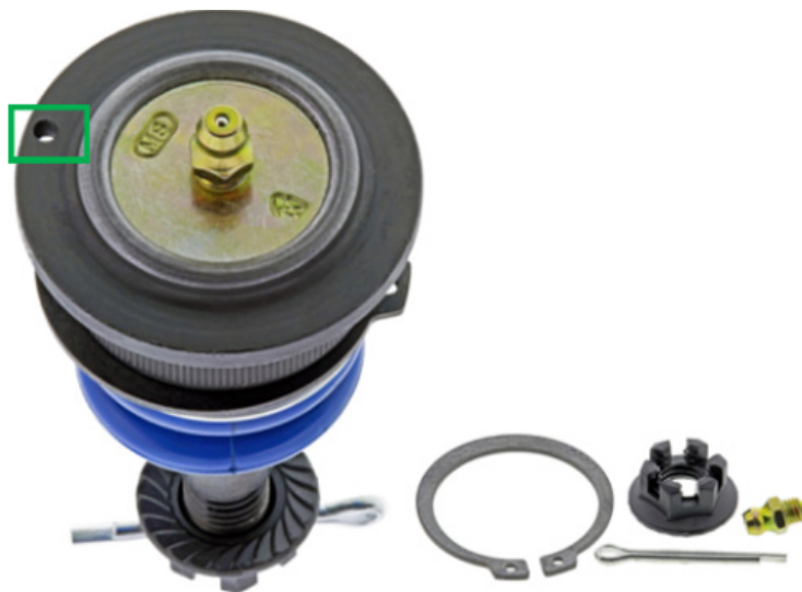
Figure 2. Drilled index mark on ball joint flange (callout box)