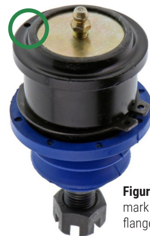
Figure 2. Drilled index mark on ball joint flange (circled)