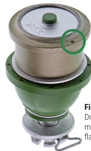
Figure 2. Drilled index mark on ball joint flange (circled)