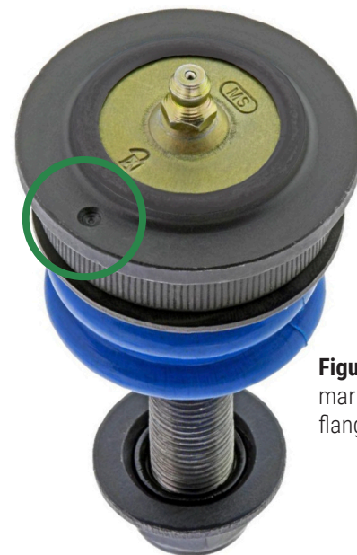
Figure 2. Drilled index mark on ball joint flange (circled)