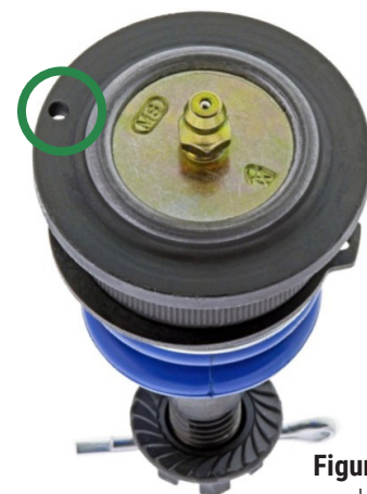
Figure 2. Drilled index mark on ball joint flange (circled)