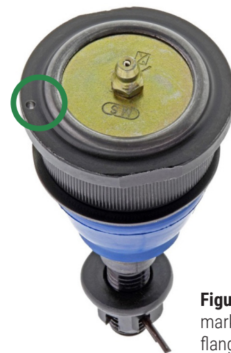
Figure 2. Drilled index mark on ball joint flange (circled)