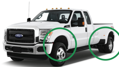
Figure 1: Wide track axle with large fender flares and dual rear wheels

When replacing tie rod ends for Ford F-350s manufactured between 2005-2016, it is important to verify the equipped axle option. Two different axle options exist: wide track (Figure 1) and non-wide track (Figure 2). Each axle option uses a different tie rod end diameter which is not interchangeable.