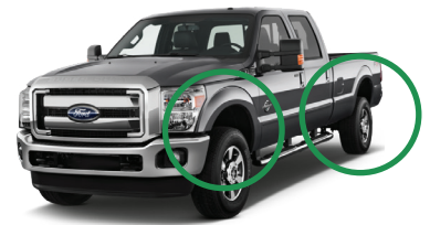
Figure 2: Non-wide track axle with regular fender flares and single rear wheel