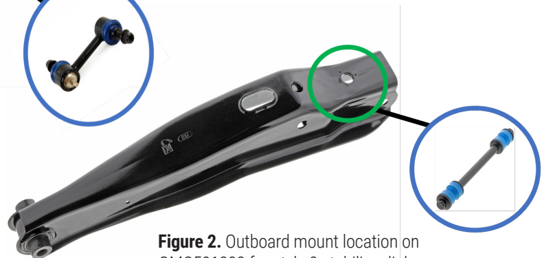
Figure 2. Outboard mount location on CMS501232 for style 2 stabilizer link