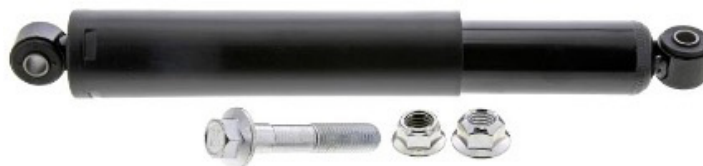
Figure 2. Mevotech Supreme steering damper MS250275 features mounting through-holes at both ends

If vehicle is equipped with 2nd Design steering linkage, use Mevotech Supreme steering damper MS250275. See Figure 2.