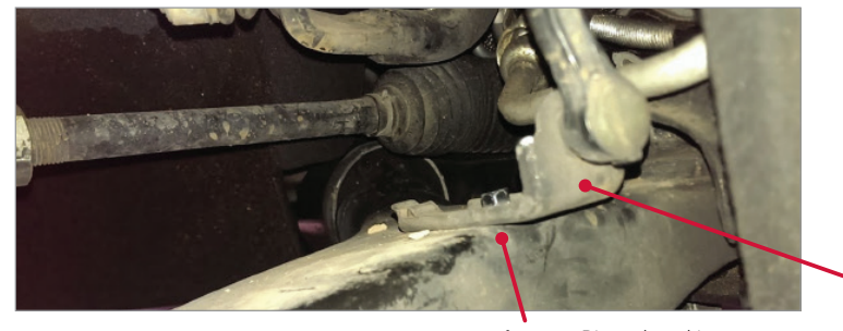
Figure 1: Rivet placed into arm, creating a mounting point for bolt

The mount point for the headlight level sensor via a bracket is the front lower control arm. This bracket is joined to the arm with a rivet nut (see Figure 1). Replacement arms will have a pre-existing locating hole; however, a new rivet nut may not be included (see Figure 2).