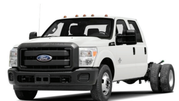
Figure 2: 2015 Ford F-350 Super Duty Chassis Cab

The chassis cab uses the narrower commercial frame, where rails are 86.6cm-86.9 (34.1in-34.2in) apart and a hump does not exist (rails are flat) over the rear axle. (Figure 2)