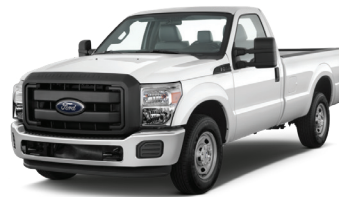
Figure 1: 2016 Ford F-250 Super Duty Pickup

The pickup uses the wider standard frame, where rails are 92.3cm-95.8cm (36.6in-37.7in) apart and there exists a "hump" over the rear axle. (Figure 1)