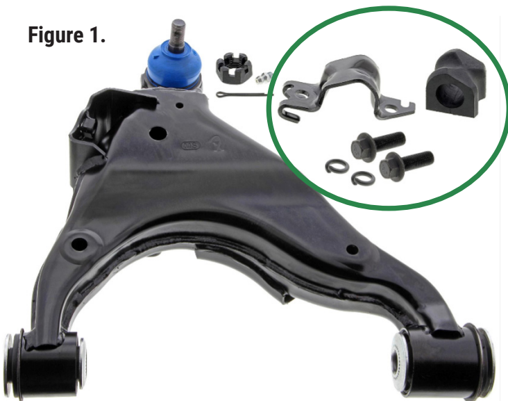
Figure 1. Mevotech Supreme front lower control arm assembly CMS861082 with additional components for KDSS-equipped vehicles (circled)