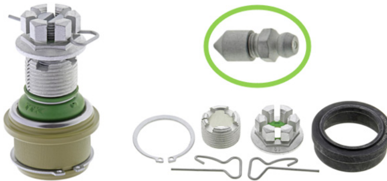
Figure 1. Hardware package features an included flush-type grease fitting (circled)

This flush-type fitting mates with all standard grease guns couplers for wide compatibility. See Figure 2.