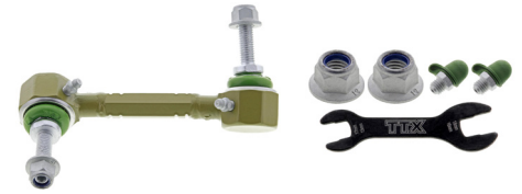
TXMS40876/TXMS40877 - REAR L/R 2019-2013 FORD POLICE INTERCEPTOR UTILITY