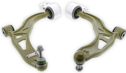
CTXMS40185/CTXMS40186 - FRONT LOWER L/R 2019-2013 FORD POLICE INTERCEPTOR UTILITY