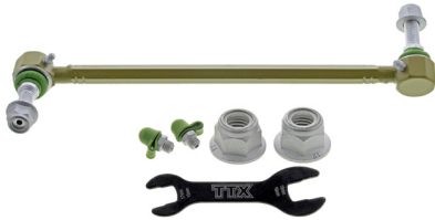
TXMS40861/TXMS40862 - FRONT L/R 2019-2013 FORD POLICE INTERCEPTOR UTILITY