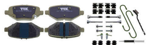
TXBPP1612 - PURSUIT CERTIFIED™