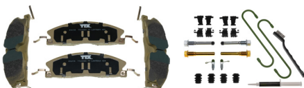
TXBPP1611A - PURSUIT CERTIFIED™