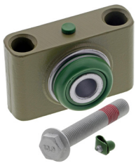
TXMS404320 - REAR UPPER REARWARD 2019-2013 FORD POLICE INTERCEPTOR UTILITY & SEDAN