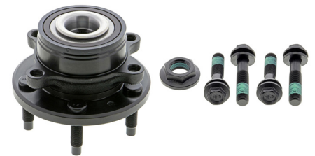
TXF512460 - FRONT | REAR 2019-2013 FORD POLICE INTERCEPTOR UTILITY