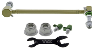
TXMS40859/TXMS40860 - FRONT L/R 2019-2013 FORD POLICE INTERCEPTOR UTILITY