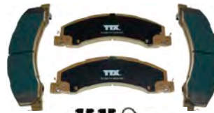
FRONT & REAR BRAKE PADS 2024-2008 RAM 4500 & 5500 TRUCK