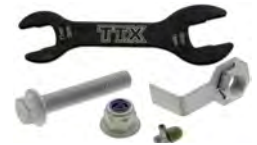
TXMS258147 - REAR 2024-2013 RAM 4500 & 5500 TRUCK