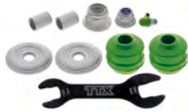
TXMS25854 - FRONT 2024-2008 RAM 4500 & 5500 TRUCK