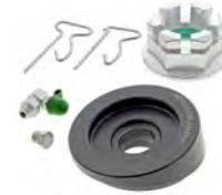
TXMS25520 - FRONT LOWER 2025-2008 RAM 4500 & 5500 TRUCK