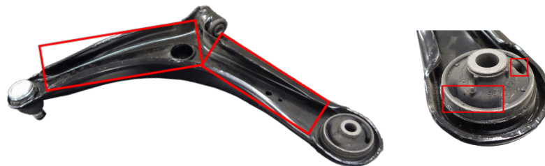
Figure 1. Mevotech Supreme front lower control arm CMS80170 featuring improved stamping profile with reinforcement plate and filled-in bushing voids (top) vs OE-style (bottom)