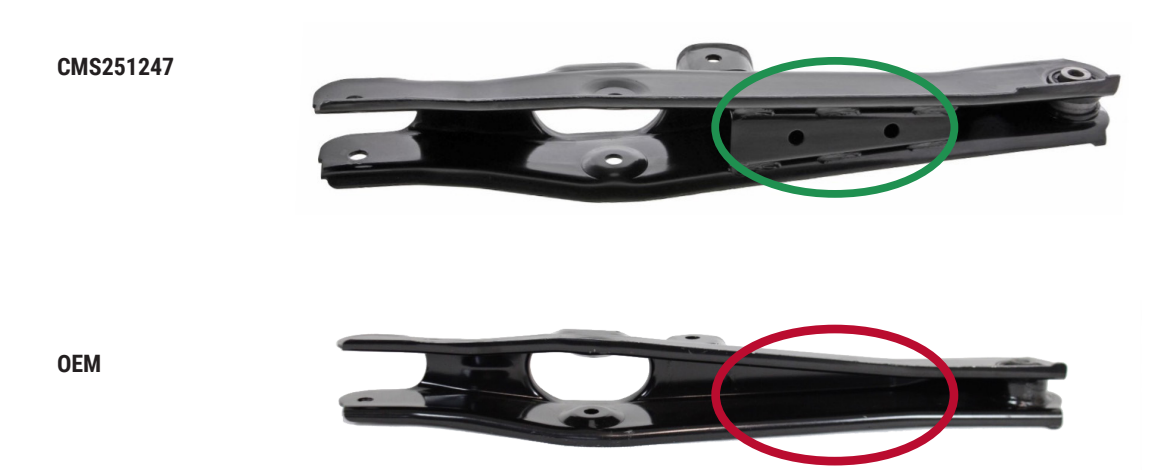
Figure 1. Mevotech Supreme lateral arm CMS251247 with improved stamping profile, featuring additional bracing (top) vs OEM design (bottom)

Mevotech Supreme rear lower rearward lateral link CMS251247 is engineered with an improved stamping profile, featuring an additional welded brace. This bracing adds rigidity and strength to the assembly as the vehicle is in motion, reducing stress on the component. Additionally, the control arm is coated with a protective anti-corrosion treatment for increased part service life. See Figure 1.